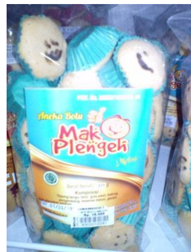
f. Kue bolu kering rasa melon