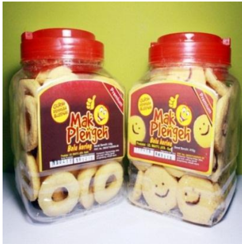
e. Kue bolu kering premium