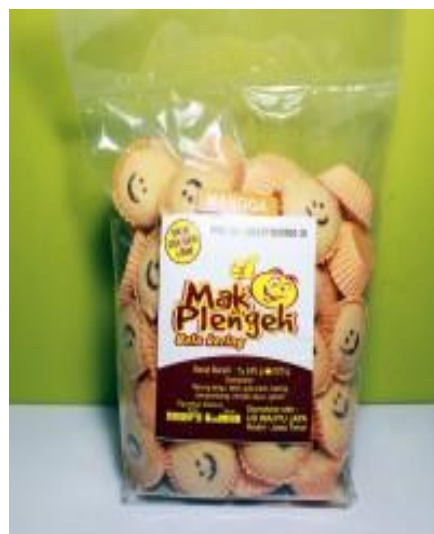
c. Kue bolu kering rasa mangga