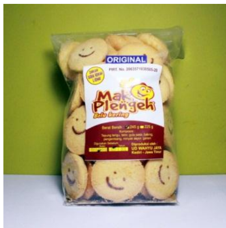
a. Kue bolu kering original