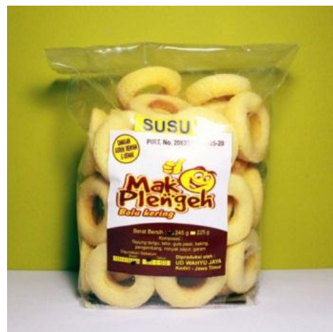
b. Kue bolu kering rasa susu