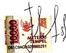
Faiza Ainus Safitri