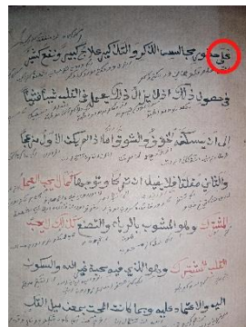
Figure 1. 3 Left Page